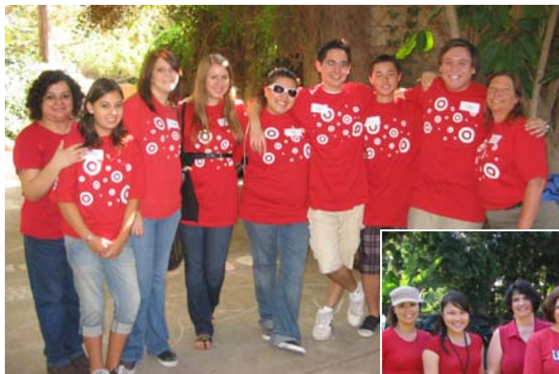
Volunteers from Target helped make the day possible.