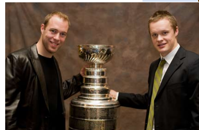
JS Giguere and Sammy Pahlsson celebrating with the Stanley Cup.