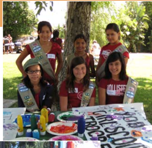
Above: Girl Scouts from Troop 58 got into the volunteer spirit.

Crucial to the afternoon's success was the hard work and dedication of volunteers and generous contributions made along the way. Organizations like Target and UPS captured the volunteer spirit by recruiting their employees to help. Additionally, the generous backpack and school supply donations from COSTCO, St. Mary's Episcopal Church, KWDZ Manufacturing and more helped ensure that each child left the picnic with a backpack full of school supplies. A grand total of 862 backpacks and pre-school bags were handed out with the help of more than 228 volunteers making the day possible.