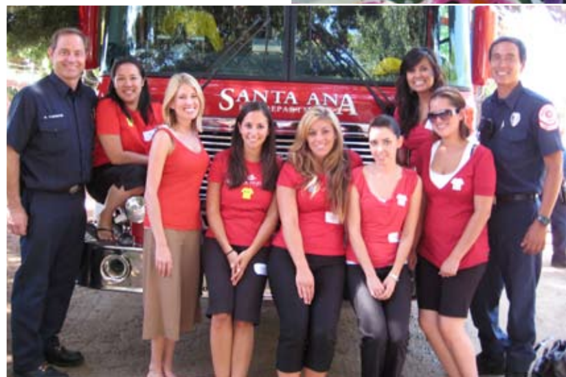
Left: Our In-Home Crisis Stabilization team members took a photo opportunity with firemen from Santa Ana Fire Station #2.