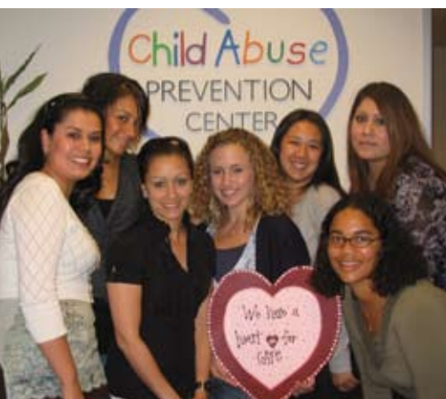
The Prevention Center's Family Support team

Over 30 individuals and companies joined forces in May to honor the mothers in our parenting programs with gift baskets. Their tremendous efforts assured that all our moms had a special Mother's Day.