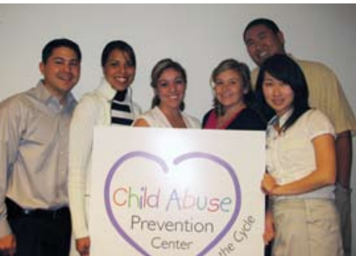
The Prevention Center's new In-Home Crisis Stabilization team

We're proud to announce our newest Prevention Center service, our In-Home Crisis Stabilization Team. Through this new program, we're now able to serve children and families who have experienced or are at risk for abuse by providing mental health interventions.