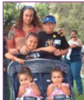
Prevention Center families from around the county enjoyed a day in the sun.