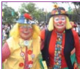
Volunteers made the day a success!

On August 12, 2004, the Orange County Child Abuse Prevention Center hosted its 1st Annual Back-to-School Picnic at the Santa Ana Zoo. Nearly 700 parents and children served by the Prevention Center enjoyed free food and refreshments, games, entertainment, face-painting, and story-telling, not to mention free backpacks filled with supplies for all school-age children. Thank you to all of the organizations and individuals whose contributions made the overwhelming success of this inaugural event possible! ♡