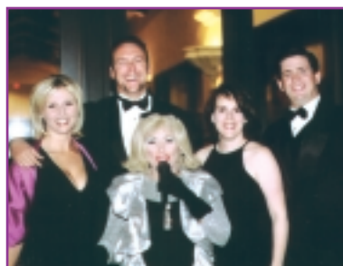
"Joan Rivers" welcomed guests.