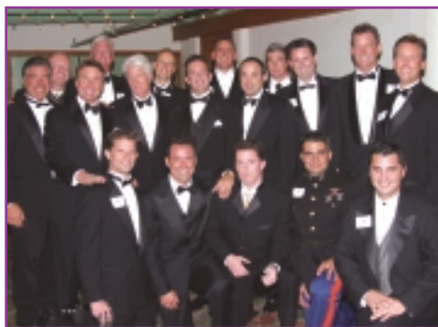
This year's Men With Heart helped raise $30,000 for Center programs.